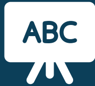
Elementary School Teachers