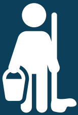
Janitors and Cleaners

Workers have a right to a safe work environment, and OSHA law prohibits employers from retaliating against employees that that exercise their rights under the law. According to government studies, the following groups have the highest rates of slips, trips, and falls in the workplace: